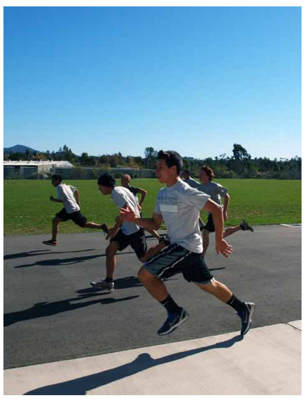
MVHS has a unique schedule that allows students to do CrossFit workouts for 90 minutes every school day for an 18-week period.

CrossFit programming forms the foundation of MVHS' general physical-education classes, which are quite distinct from what we might expect of typical high-school athletics departments. In the CrossFit classes, the focus is on technique first, and then students progress to light weights, which are scaled for each student. They do the Burgener Warm-Up, work out with PVC pipe and focus on movements that take advantage of their body weight.