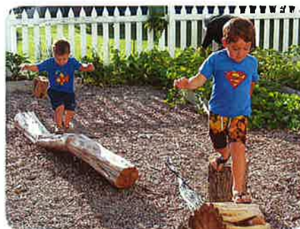
Here children have made a long pathway with multiple natural elements outdoors.