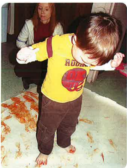
Here infants and toddlers make visible paths indoors by putting paint on barefeet and walking on paper!