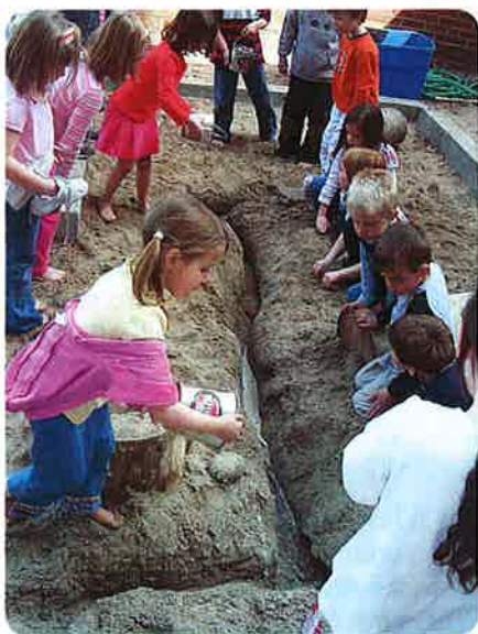
A group of children create a path in sand, then fill it with water.