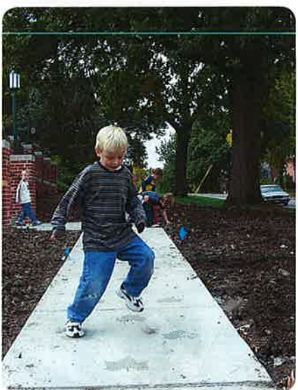
Children find paths in their neighborhoods and in their environment. A sidewalk with leaf prints, a wood chip trail in the woods or even a stream of water all make unique pathways.