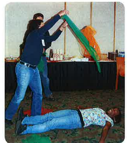
It’s a good idea for teachers to “try out” pathways that children create.

We’re here to help! 1-888-908-8733 | info@natureexplore.org | natureexplore.org