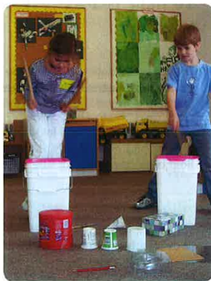
Elementary children make paths indoors using recyclable materials.