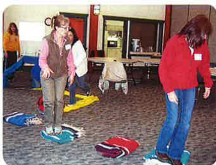
Teachers follow paths children have created with blankets.