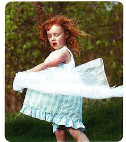
This child uses fabric to “twist” as she walks along a pathway.