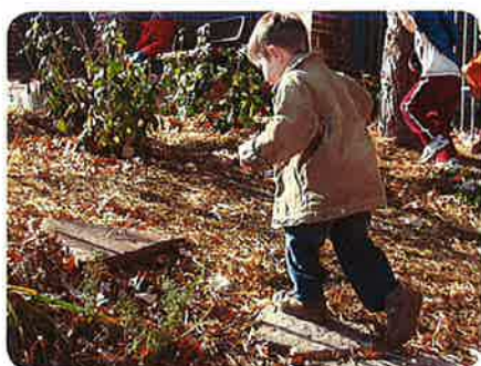
Children walk pathways outdoors made with simple stepping stones.