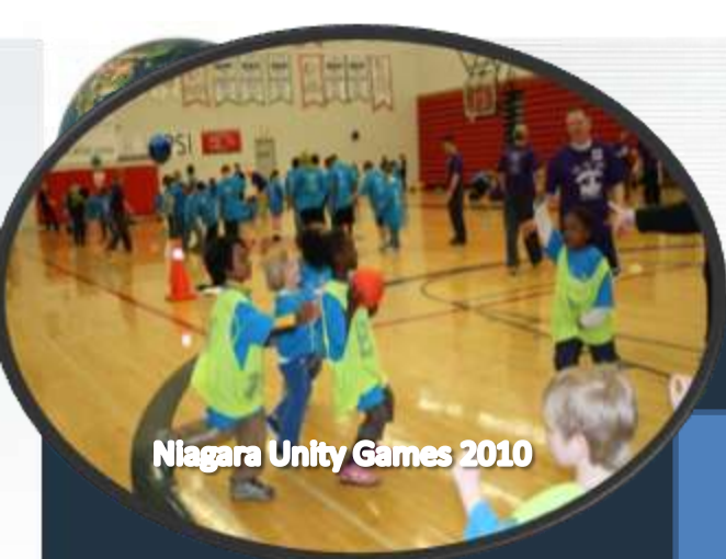
Niagara Unity Games 2010