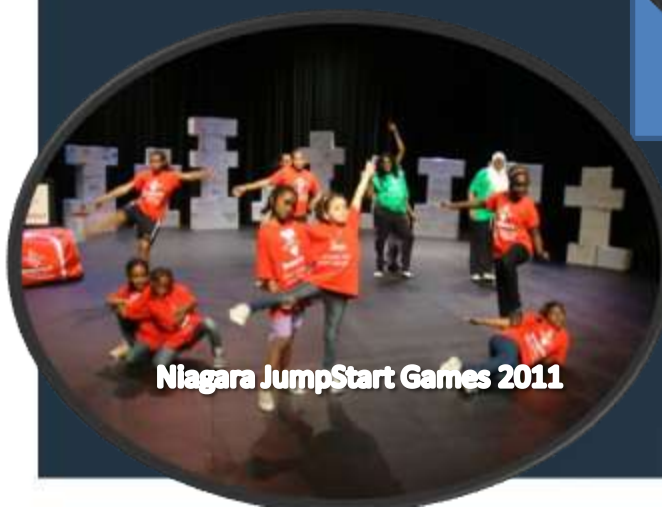
Niagara JumpStart Games 2011