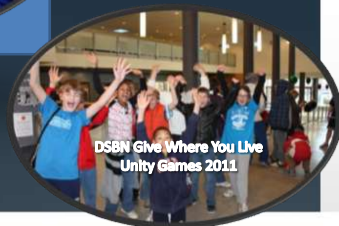
DSBN Give Where You Live Unity Games 2011