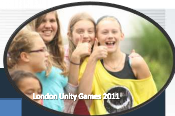
London Unity Games 2011