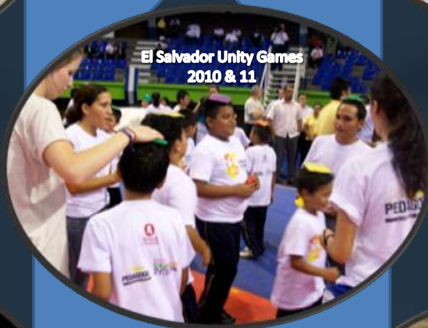
El Salvador Unity Games 2010 & 11